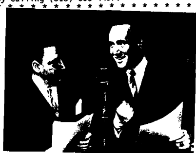
f Earl Wilson turns actor in WOR's Boston Blackie." Dick Kollmar (right), who portrays the colorful adventurer in the popular series, shows Earl how to "punch" lines.

I have received a two page ad for another new book, FROM OUT OF THE PAST: A PICTORIAL HISTORY OF THE LONE RANGER, from Holland House, 17142 Index Street, Granada Hills, CA 91344. It carries a pretty hefty price of $40.00 plus $3.50 shipping and nowhere in the ad does it mention the number of pages or size of the book. If you are interested, you can get further information from them by calling (818) 363-4497.